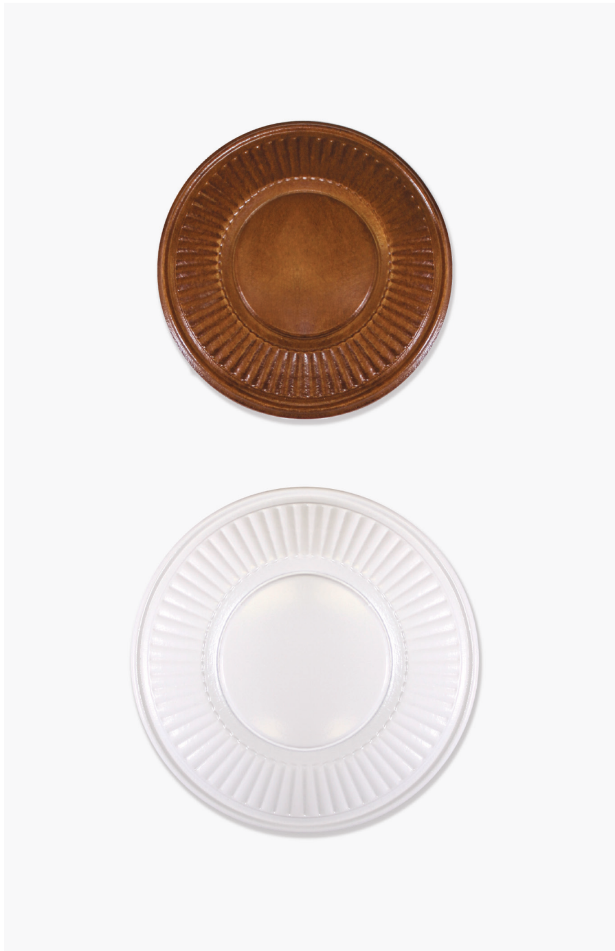
HOLDBACK Estate Oak, White Shown. Available in: 3", 4½".