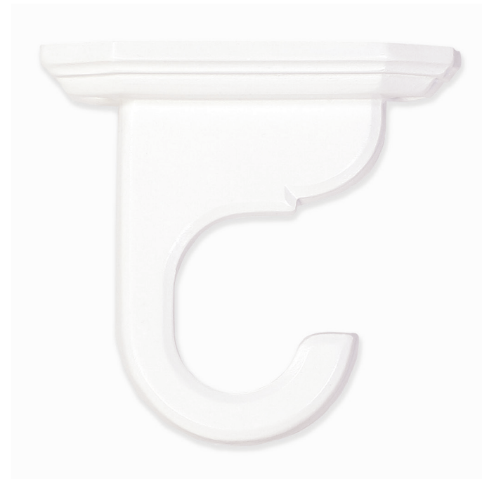
CEILING BRACKET White Shown. Available in: 1 3/8", 2".