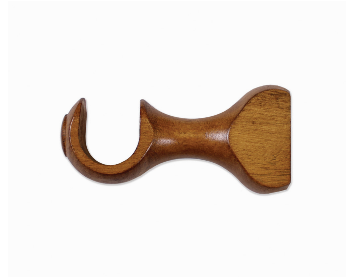
1 3/8" DECORATIVE BRACKET Estate Oak Shown, 4 1/2" Return.