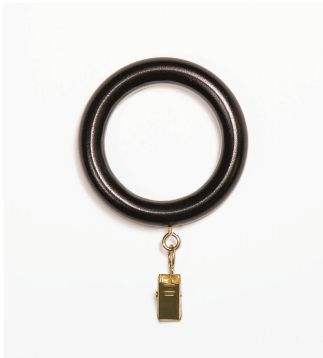
SMOOTH RINGS Dark Chocolate Shown. Available in: 1 3/4".