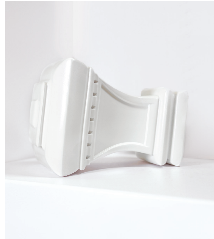
BRISTOL Marble Shown. Available in: 1 3/8", 2", 3".