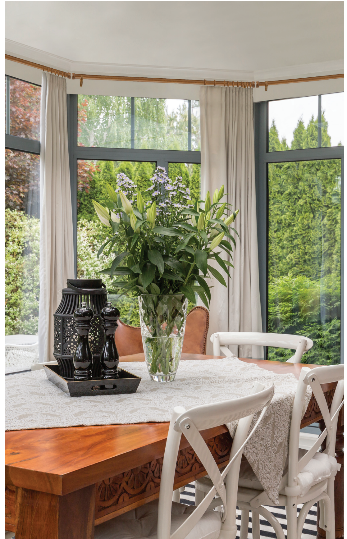
ENDCAP Estate Oak Shown