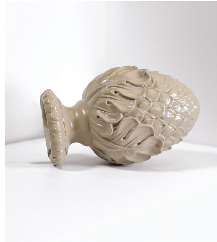
OAKLEAF Truffle Shown. Available in: 1 3/8", 2", 3".