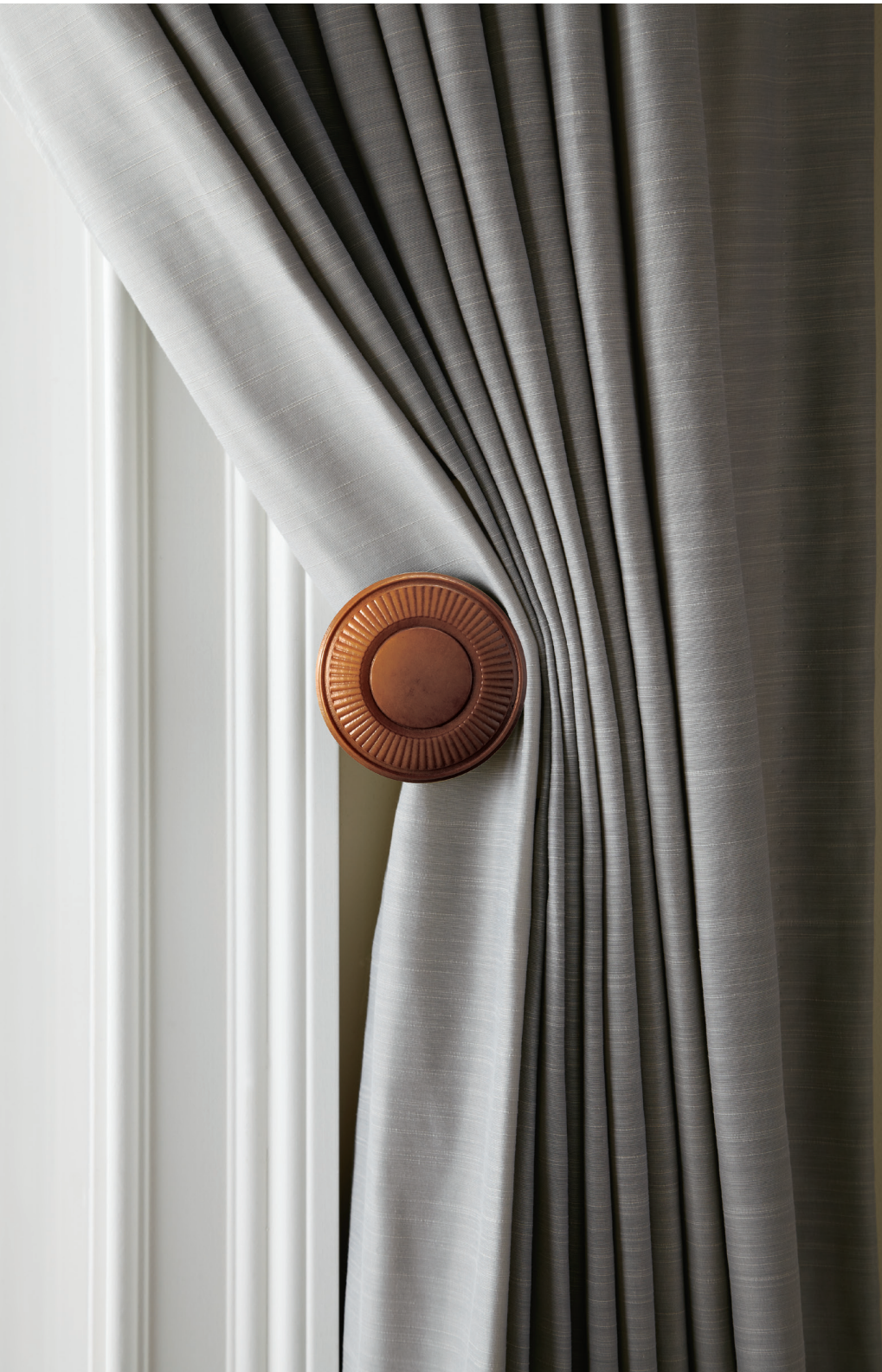
HOLDBACK Estate Oak Shown