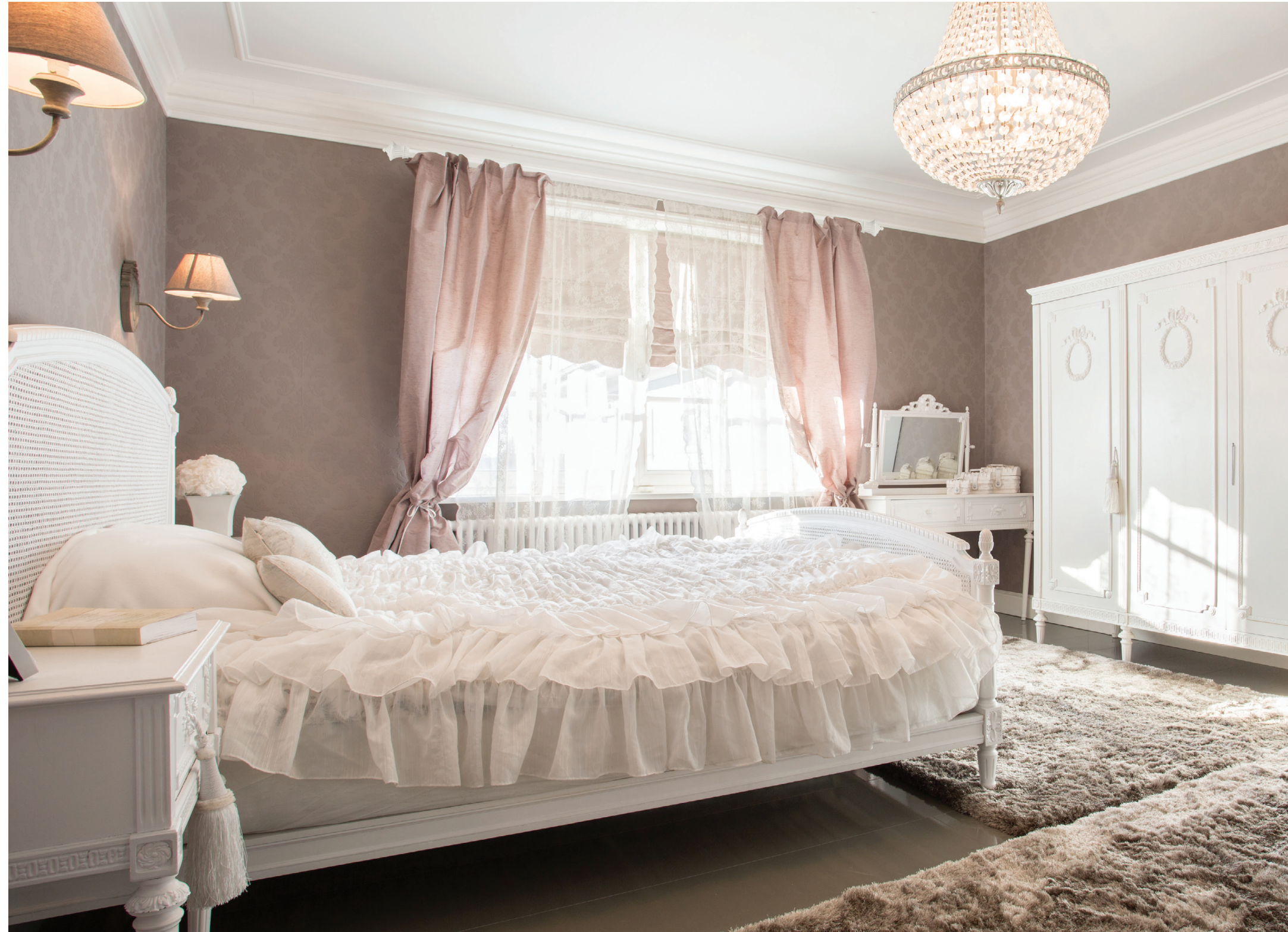
CHARLESTON White Shown