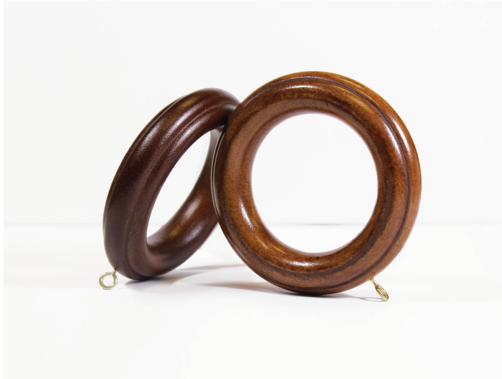
FLUTED RINGS Mahogany, Estate Oak Shown. Available in: 2", 3".