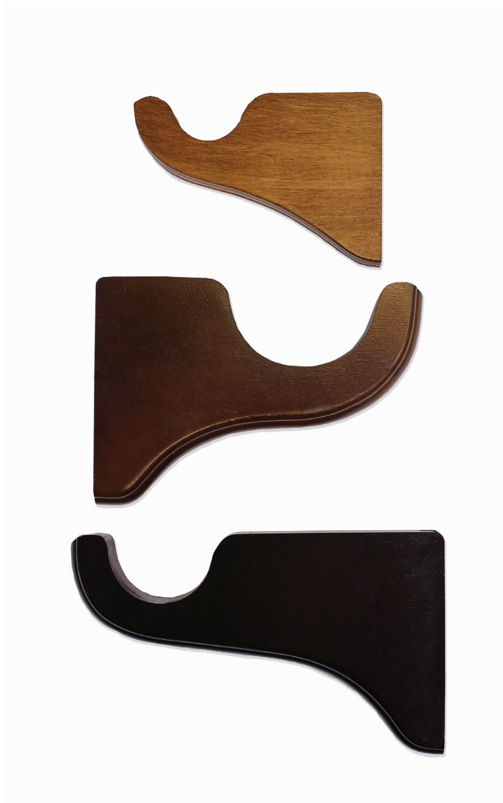
1 3/8" STANDARD Estate Oak, 3 1/2" Return Shown. Available Returns: 3 1/2" and 6".