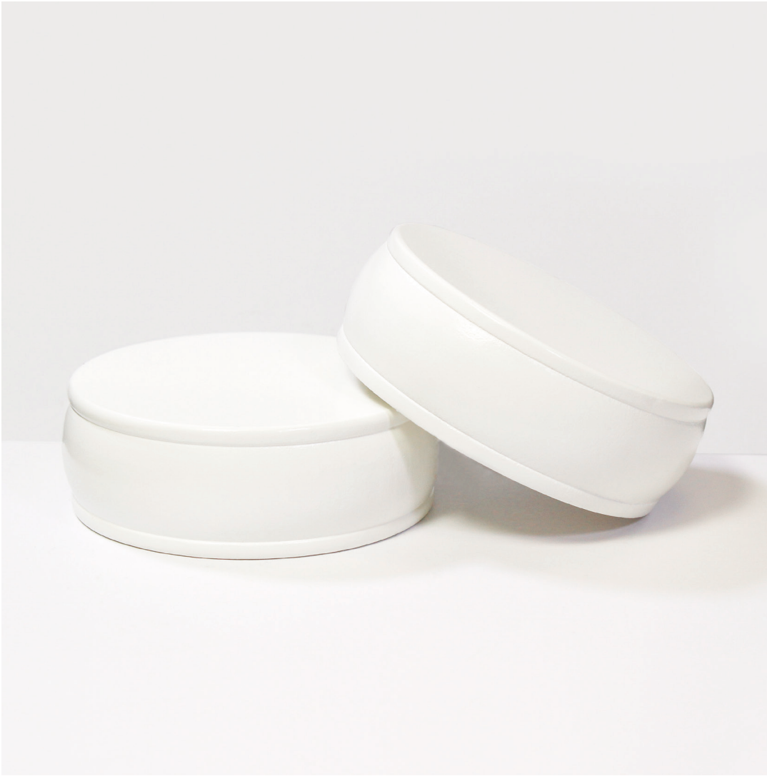
ENDCAP White Shown. Available in: 1 3/4", 2", 3".