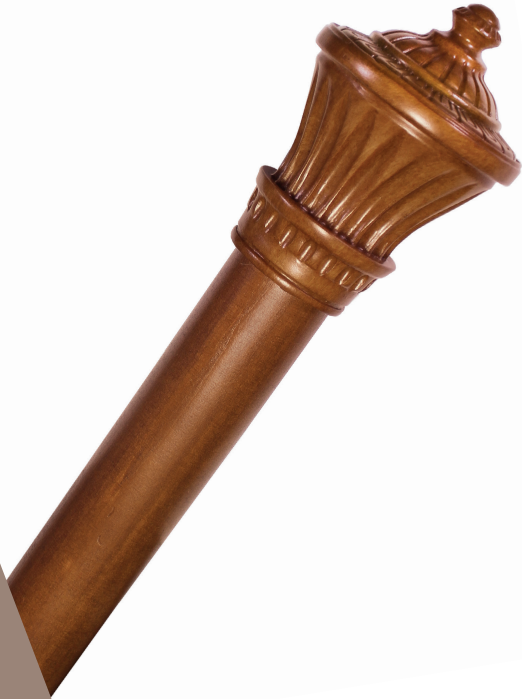
CHARLESTON Estate Oak Shown. Available in: 1 3/8", 2", 3".