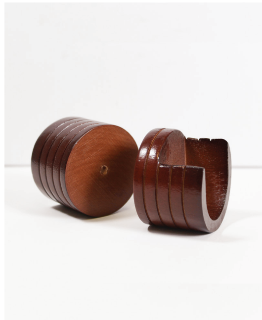
SWIVEL SOCKET Estate Oak Shown. Available in: 1 3/8", 2", 3".