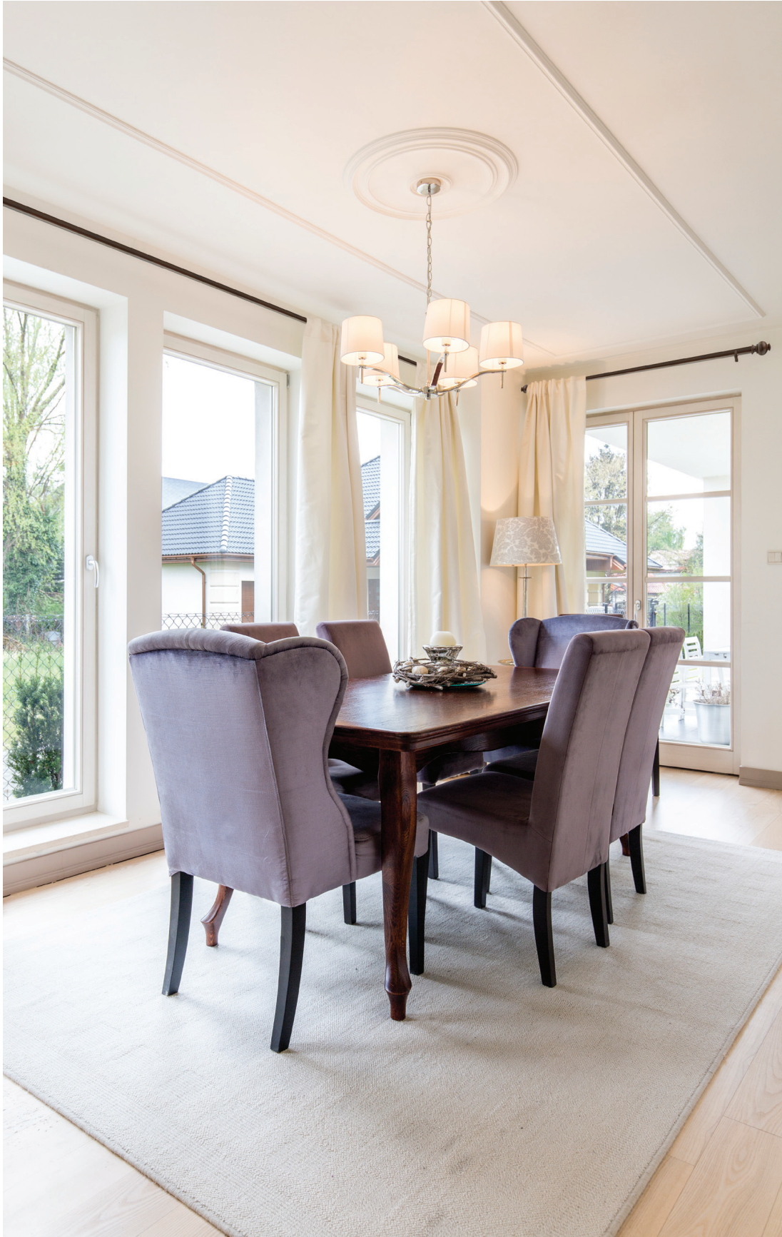
BUTTON BALL Black Shown